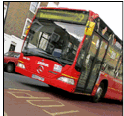
Buses & trams