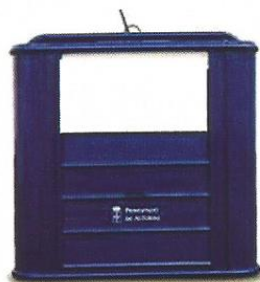
paper and cardboard