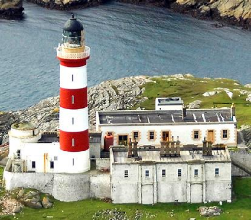
Eilean Glas Lighthouse (Scotland)