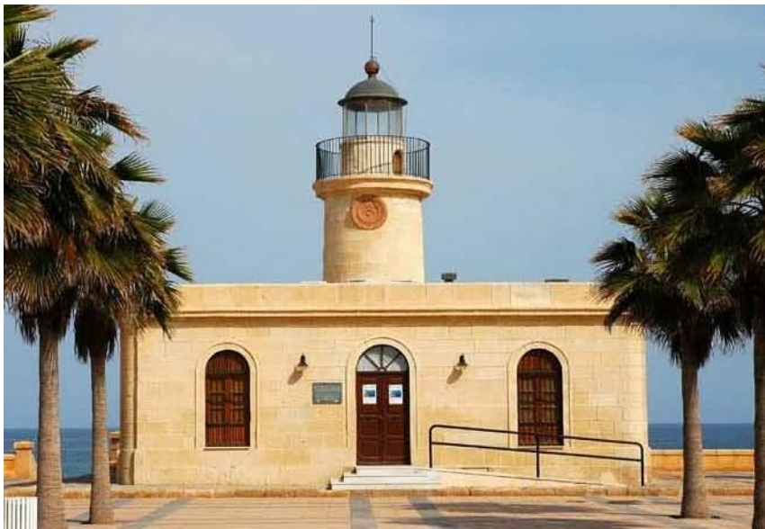
Lighthouse at Roquetas de Mar (Almeria, Spain)