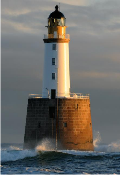
Rattray Head Lighthouse (Scotland)